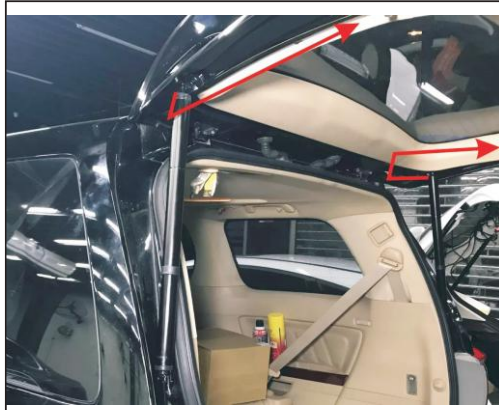
5. Remove the plaque, door trim lines to hall go to end