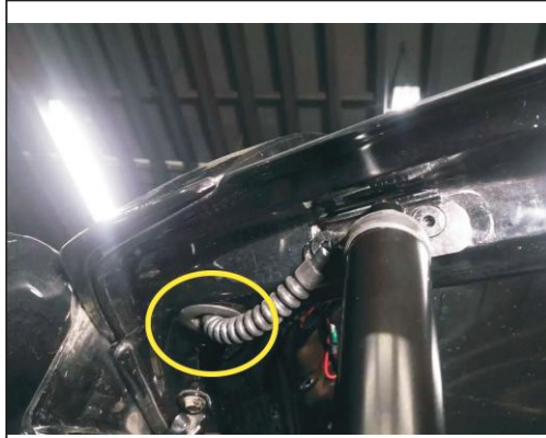
2. In the original car left bracket installation we poles (with the poles on line up), remove the original car stopper, lines to poles go down from above