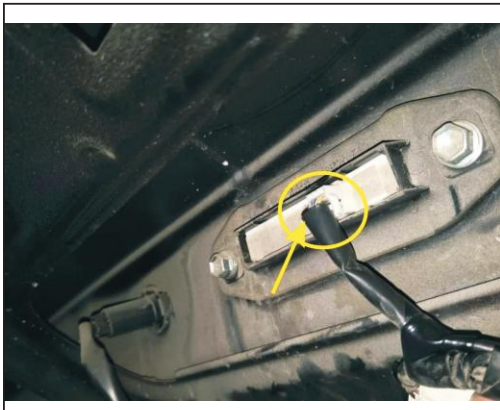
10. Pull off the back door to transfer before we switch socket socket