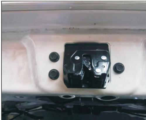
11. Remove the original car door lock on our electric suction installation, use the original car screws