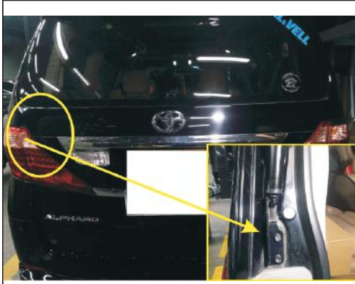
1. Remove the original car poles and lower left leg, install our bottom bracket (ball head toward the car), with the original screw fixation