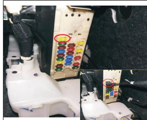
6. On the right side of the main drive below, unplug the original 20 a fuse, connect our power plug