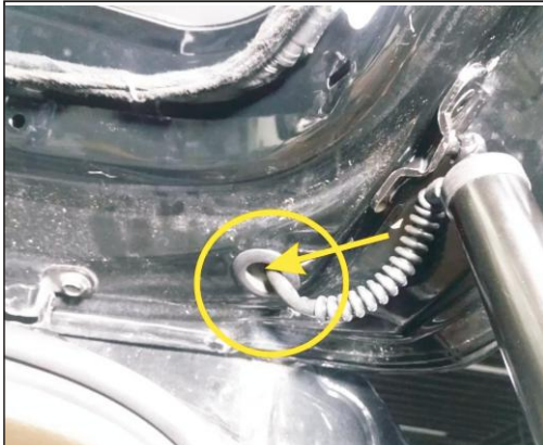
4. In the original car right bracket installation we poles (with the poles on line up), remove the original car stopper, lines to poles go down from above