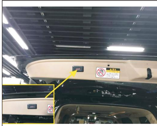
14. Stern door key installation location