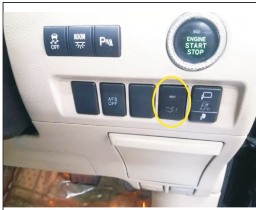
8. Main driving position according to the figure to find corresponding, special switch will spare parts for replacement