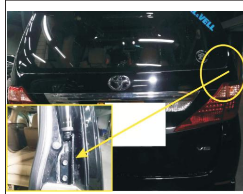
3. Remove the original car poles and right bracket, installation we lower bracket (ball head toward the car), with the original screw fixation