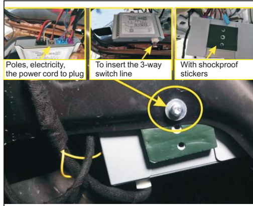
13. Installation position and control box, according to the color, shape will be socket head on the corresponding socket (pay attention to check whether the plug tight)